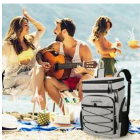
Beach backpack cooler