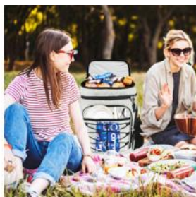
Camping backpack cooler