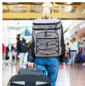
Travel backpack cooler