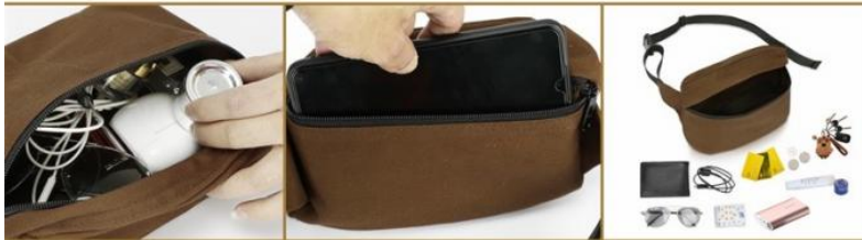
Main bag display