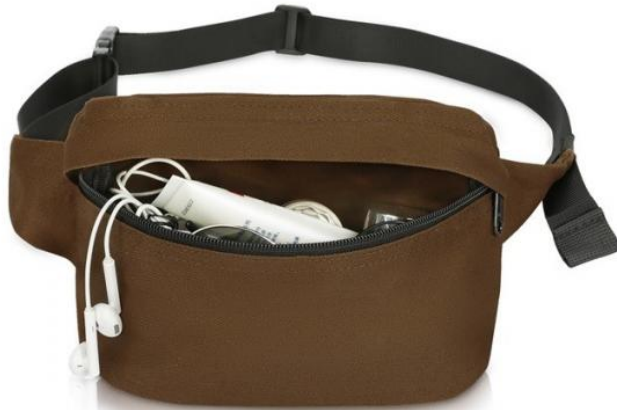
Large capacity storage