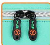
RUBBER ZIPPER PULLER