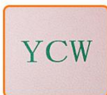
SILK SCREEN PRINTING