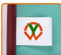
WASHING CARE LABEL