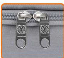
METAL DEBOSSD ZIPPER PULLER