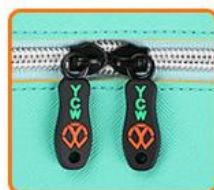
RUBBER ZIPPER PULLER