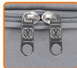
METAL DEBOSSSED ZIPPER PULLER