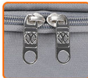
METAL DEBOSSD ZIPPER PULLER