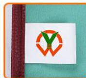
WASHING CARE LABEL