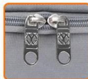
METAL DEBOSSED ZIPPER PULLER