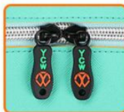
RUBBER ZIPPER PULLER