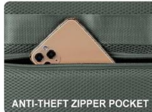
ANTI-THEFT ZIPPER POCKET