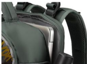
Can fit up to 14inch laptop