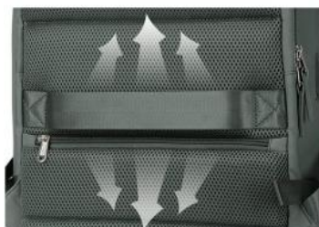
Relieve stress of your shoulder